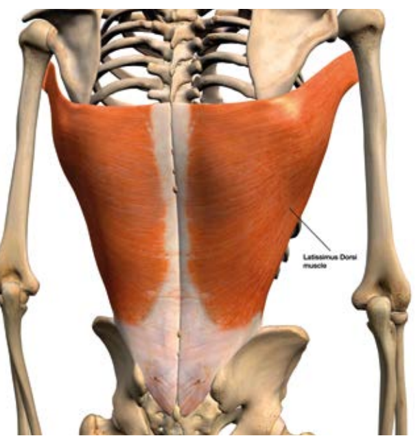
This broad muscle could be an important piece of the puzzle for a better back.